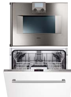
DF + BM