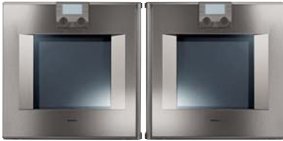
BO + BO