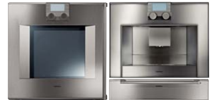
BO + (CM + WS 14 cm)