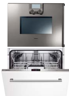
DF + BS