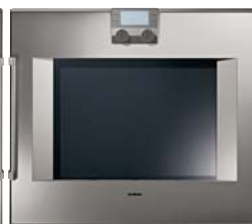
BO + BO (optionally + WS)

All combinations on this page are available in the following appliance colours: Stainless steel-backed full glass door, Aluminium-backed full glass door, Anthracite full glass door. (For DF the fronts are available in all appliance colours as a special accessory.)