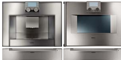
(CM + WS 14 cm) + (BM + WS 14 cm)