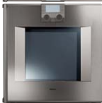
BM + BO + WS 29 cm