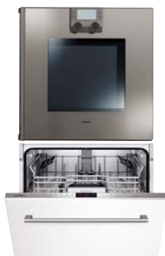
DF + BO