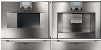
(BS + WS 14 cm) + (CM + WS 14 cm)