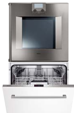
DF + BO