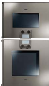
BS + BO