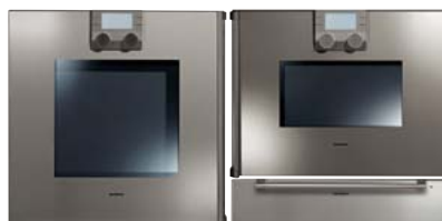
BO + (BS + WS 14 cm)