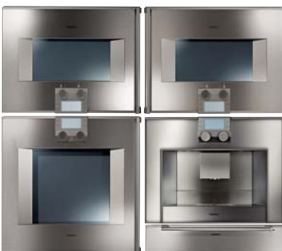
BS + BM + BO + (CM + WS 14 cm)