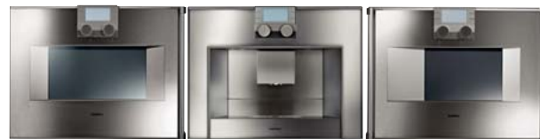
BM + CM + BS (optionally + WS 14 cm)