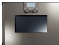
Stainless steel-coloured full glass door