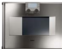
Stainless steel-backed full glass door