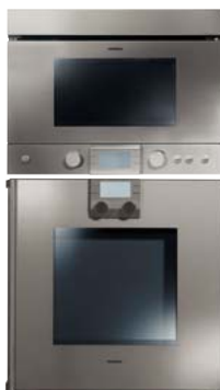
(BM + BA 266) + BO