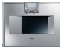
Aluminium-backed full glass door