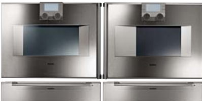
(BM + WS 14 cm) + (BS + WS 14 cm)