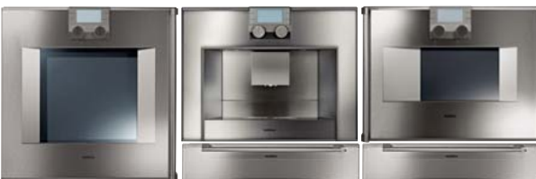
BO + (CM + WS 14 cm) + (BS + WS 14 cm)