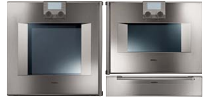
BO + (BM + WS 14 cm)