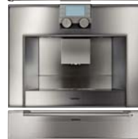
CM + BS + WS 14 cm