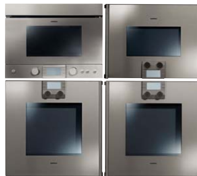
(BM + BA 266) + BS + BO + BO