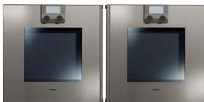
BO + BO