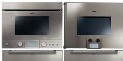
(BM + BA 266 + WS 14 cm) + (BS + WS 14 cm)

All combinations on this page are available in the following appliance colours: Stainless steel-coloured full glass door, Aluminium-coloured full glass door.