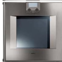
BS + BO + WS 29 cm