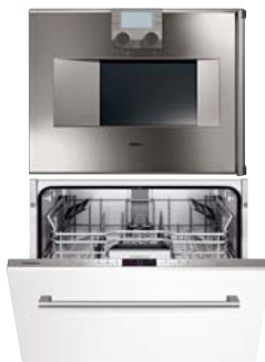
DF + BS