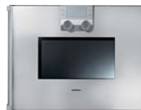
Aluminium-coloured full glass door