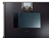
Anthracite full glass door