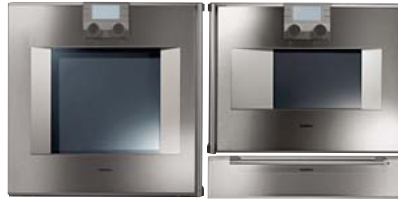
BO + (BS + WS 14 cm)